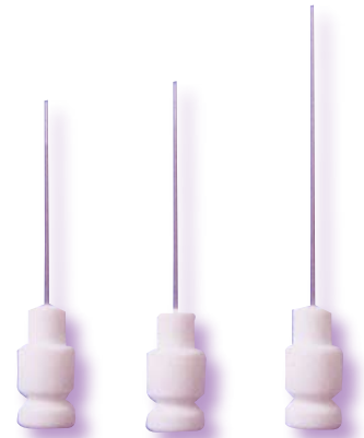
CAN500-DK CAN900-DK CAN10K-DK

DK Series Sampling Probes are Distek compatible and use DK Series filters.